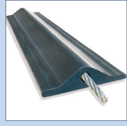
For use with static loads only.