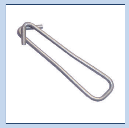
Loads tested to a 5:1 safety factor. For use with static loads only.