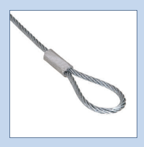
Loads tested to a 5:1 safety factor. All ratings were determined by independent testing at Northumbria University and witnessed by Lloyds Register.