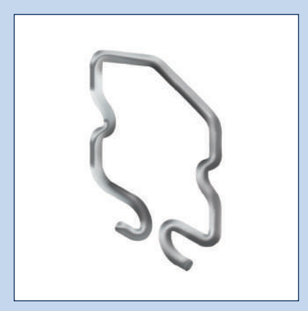
Loads tested to a 3:1 safety factor. For use with static loads only.