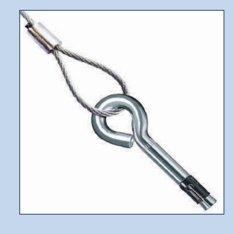
Loads tested to a 5:1 safety factor. For use with static loads only.

The FNA Anchor when detached from the wire has an individual maximum downward static load rating of 0.7kN (70Kg approx.) with a 4:1 safety ratio. *Please contact the Sales department for further information.