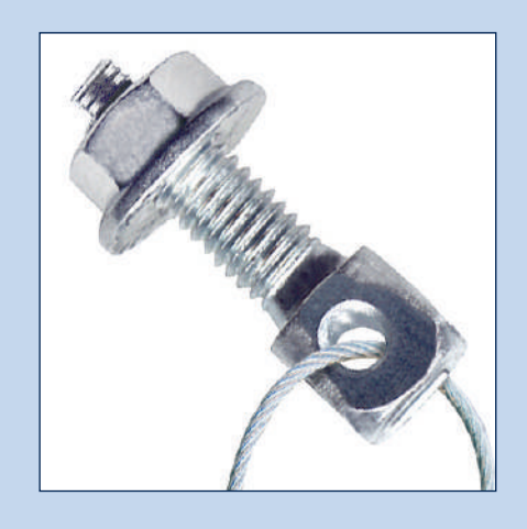
Loads tested to a 5:1 safety factor. For use with static loads only.