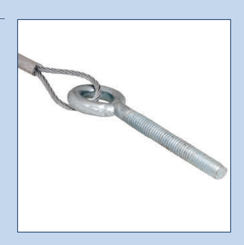
*Please contact the sales department for M8 Eye Bolt